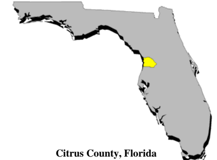
Citrus County, Florida